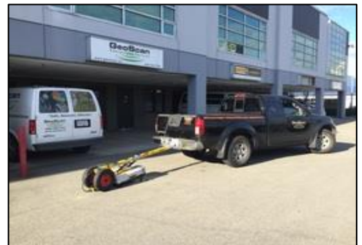
GPR Data Showing Asphalt Thickness

The survey revealed the extent of the asphalt thickness and highlighted the areas which actually needed repairing therefore saving time and money resurfacing unnecessary portions of the road.